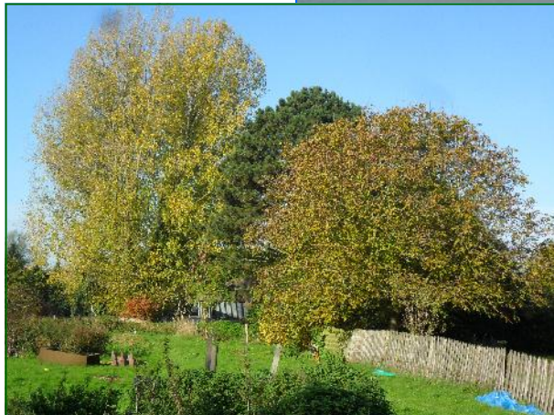
photo taken on 12 November from Parish Footpath No 10 near Hollow Farm).