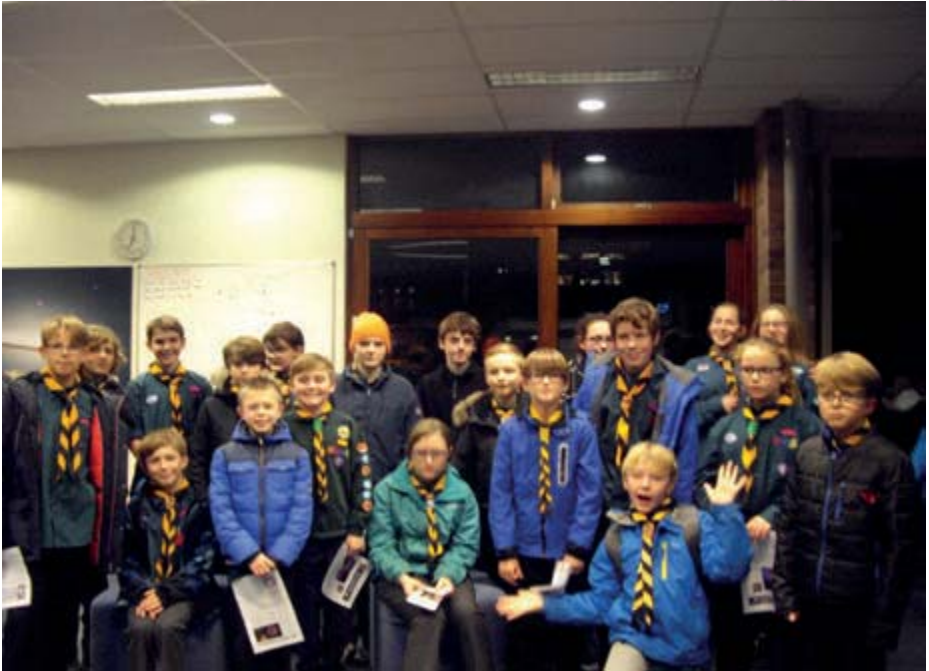
Fenstanton and Hilton Scouts at the Cambridge Institute of Astronomy

One copy delivered free to each household ten times per year. Available online at: