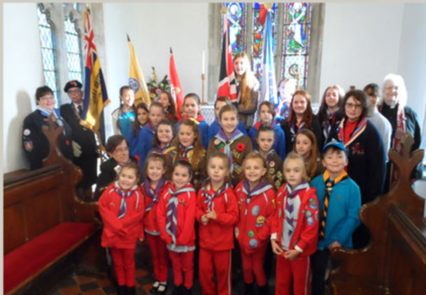
Uniformed attendance at the Remembrance Service in Hilton Church