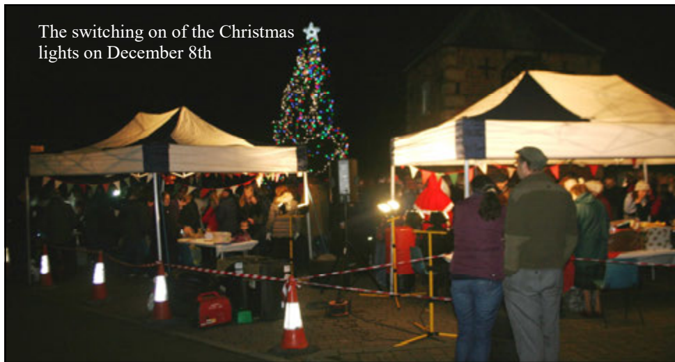
The switching on of the Christmas lights on December 8th