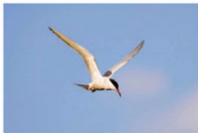
Common tern

Unlike their coastal nesting cousins, common tern can often be found on inland lakes in the breeding season. As ground nesters, terns do not build nests in trees. Instead, they lay their eggs directly on the ground or on a small pile of vegetation, usually favouring sandy or gravelly areas where their eggs and chicks are adapted to be well camouflaged.