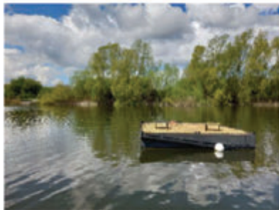
Tern raft on Ferry Lake - Henry Cook

When looking out over Ferry Lake in the spring and summer, particularly from the picnic tables near the car park or from the northern view shelter overlooking Ferry Mere, you may notice some rafts floating out on the water. You can see these same constructions from the hide on Moore Lake. These are our tern rafts and are specially made artificial nesting platforms for common tern.