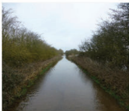
Flood waters over Holywell Ferry Road - Simon Freedman

The flood waters will also top up all our shallow pools (scrapes) around the site and leave a lot of mud around the edges of the lakes. Both of these features will help lapwing and other breeding waders.