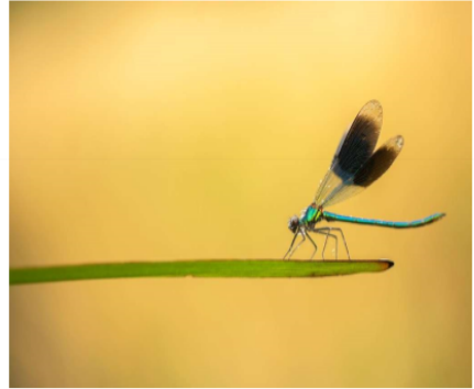
The banded demoiselle is a vision of elegance

The best places to look for many of these aerial predators are wetland margins, ideally around ponds, small lakes, slow-flowing rivers and streams. RSPB Fen Drayton Lakes provides a profusion of suitable places to see various species. Two of the best areas to concentrate your efforts